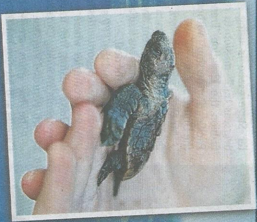
GREENIE: A green sea turtle takes a dip; and (inset) a hatchling at Mon Repos. Pictures: Nigel Hallett